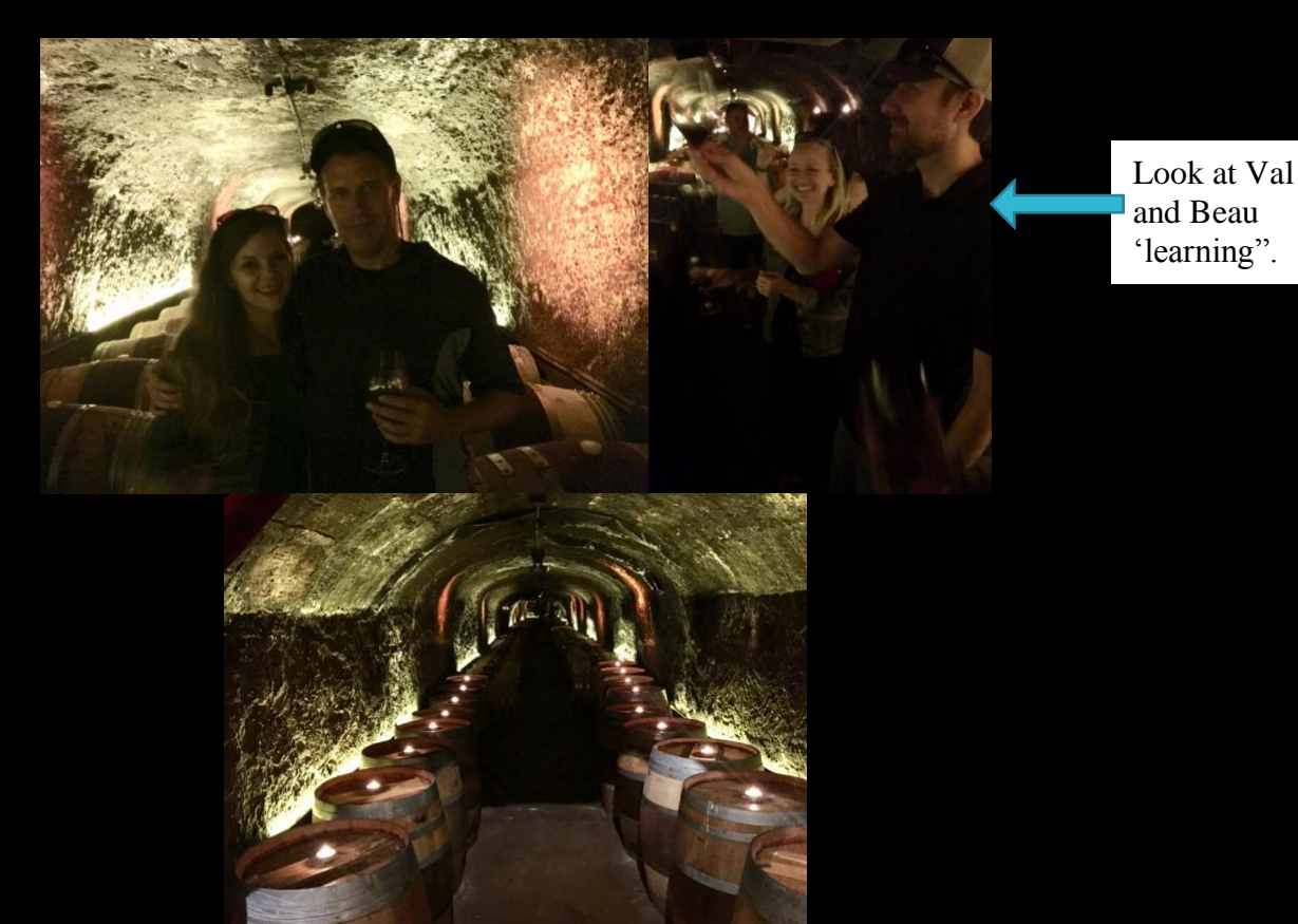
A look into the Del Dotto Cave Cellar

Pro tip: You should also be aware that the wines you'll taste are still immature and not the refined, fully ready-to-drink wines that you might sample in other wineries. Don't let that deter you from going—the experience is all part of learning to appreciate wine and enjoy it. We really did!